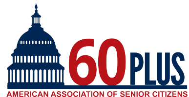
60 Plus Association