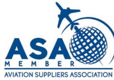
Aviation Suppliers Association