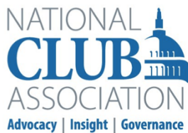
National Club Association