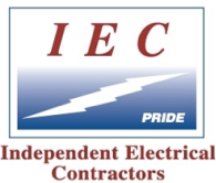
Independent Electrical Contractors