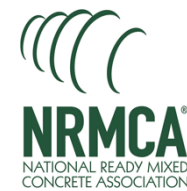
National Ready Mixed Concrete Association