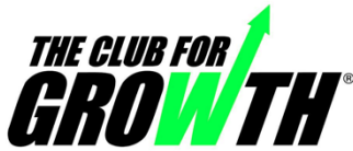
Club for Growth