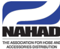
NAHAD The Association for Hose and Accessories Distribution