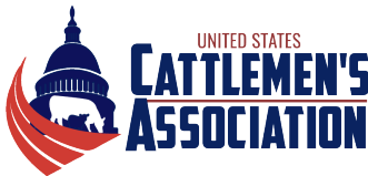
United States Cattlemen's Association