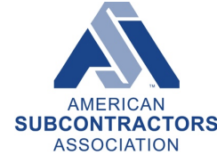
American Subcontractors Association