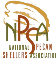
National Pecan Shellers Association