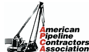
American Pipeline Contractors Association